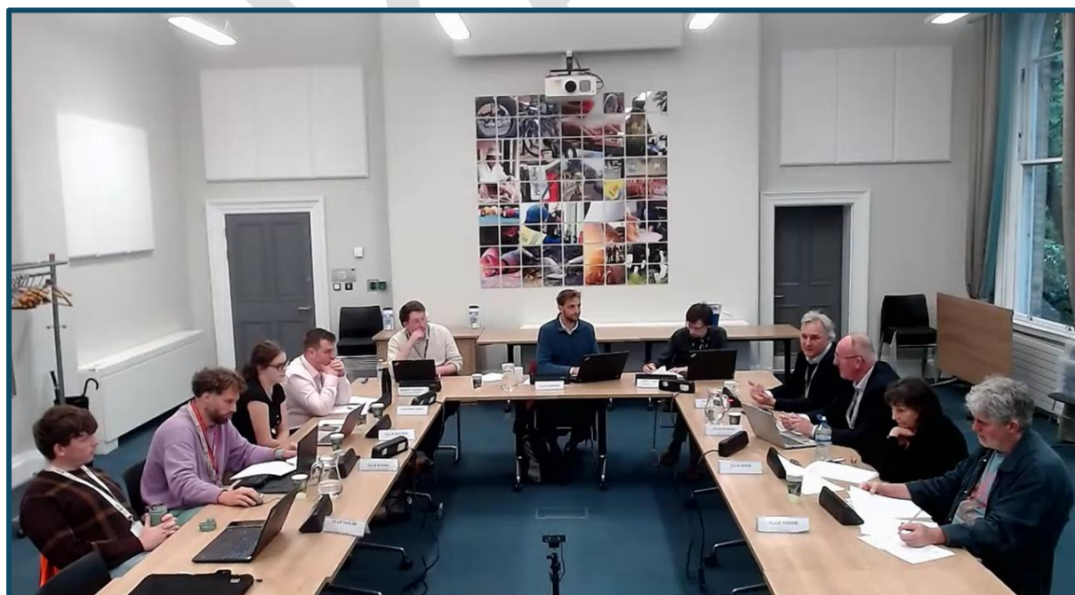
Place Scrutiny Committee, 23 September 2025