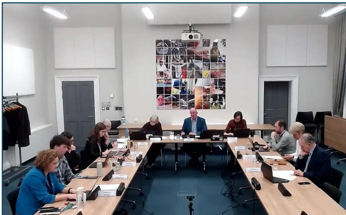
Corporate Scrutiny Committee, 3 March 2026