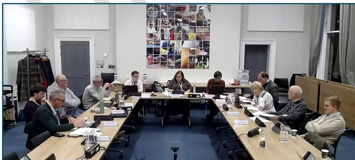
People Scrutiny Committee, 3 December 2025